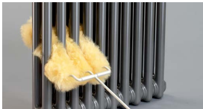
Zehnder lambswool cleaning brush

V20180901, RAD_DAS, SL_en, subject to change without notice