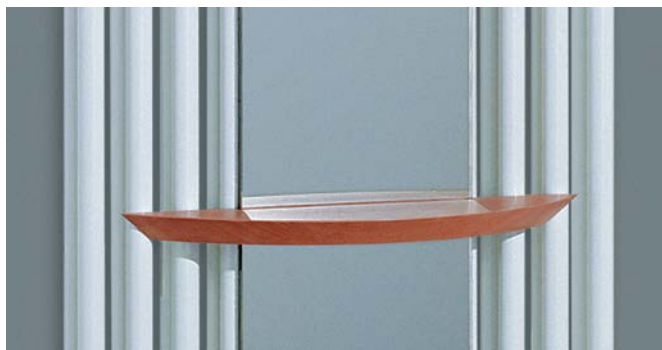
Optional wooden storage option made of solid beech, painted in silk matt