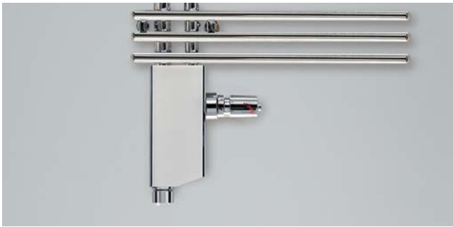
Connection fittings with cover in chrome for dual energy operation version.