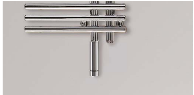
Electric operation version with integrated electric heating element WIVAR BASIC RF.